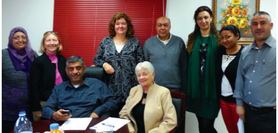
CRT and Women Reborn team with Mayor of Jisser Al Zarka and staff.

During 2012, CRT activities began to demonstrate some results that could not have been anticipated. On a recent trip to Israel, we had the opportunity to meet with the mayors of the three Arab villages in which the Women Reborn program is now operating – Fureidis, Jisser Al Zarka, and Ein Al Sahla. We were heartened to find that in all three villages, Women Reborn is now thoroughly interwoven with municipal plans for social and economic development. Even more surprising, all three mayors expressed enthusiastic support for the political empowerment of the women of their village, even searching for a woman candidate to run as their “second” in the 2013 election. This is an example of how a successful grassroots project can create and nurture relationships among local political and cultural figures in such a way that critical social norms are radically changed.